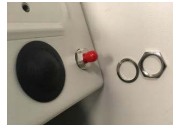
Figure 8: Install surge protector

14. Secure the surge protector to the enclosure with the provided split washer and hex nut.