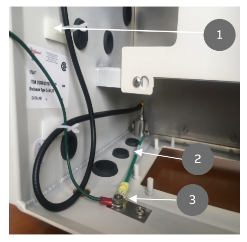
Figure 10: Cable assembly