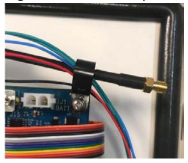
Figure 2: Cable clamp

2. Attach the right angle SMA fitting of the cable to the board ANT-1, connector (J42).