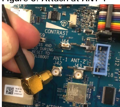
Figure 3: Attach at ANT 1

2. Attach the right angle SMA fitting of the cable to the board ANT-1, connector (J42).