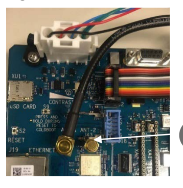
Figure 13: ANT-2 terminator plug

20. Attach the terminator plug to the board ANT-2, connector (J43). (see number 1, below).