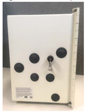
Figure 11: FCC compliance tag