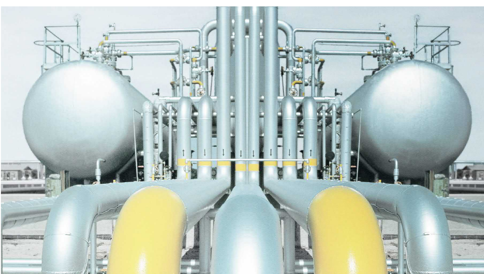
ABB has developed manufacturing methods which ensure all of our laboratory and process FT-NIR analyzers are highly stable, have a highly linear photometric response, and provide identical absorbance spectra. This guarantees calibration transferability from lab to process without any additional calibration effort or data manipulation.