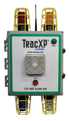
TXP-ANA Wireless with Hush