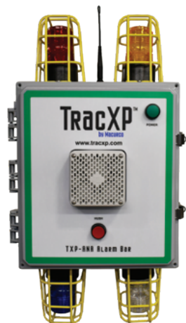
TXP-ANA Wireless with Hush