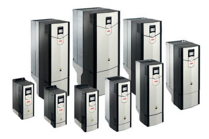
The ACS880 product family is available in a power range from 0.55 to 5600 kW and at voltages of 230, 400, 500 and 690 V. Enclosure class options are IP20, IP21 and IP55. Tower crane control software ordering code is +N5650.

Slew Smooth jib rotation without oscillation