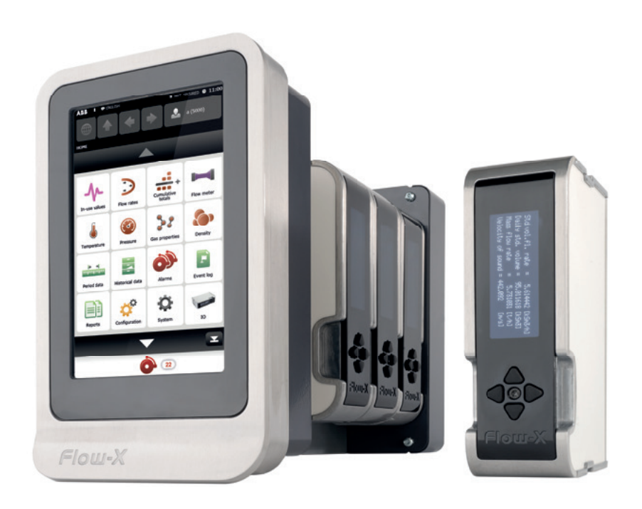
ABB challenges traditional flow-measurement technologies with a unique concept. The modular Spirit<sup>IT</sup> Flow-X series offers advanced measurement technology together with powerful and flexible computation and communication capabilities.

The Spirit<sup>IT</sup> Flow-X series is designed to compute and control liquid and gas flows to the highest measurement standards. The series is based on powerful single-stream modules, which can be combined in racks of up to eight. Each module offers real-time digital and analog signal processing, supporting the custody transfer of crude oil, natural gas, refined products, special gases and steam, among others.