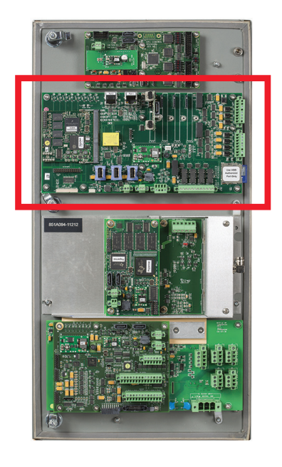
Fig. 1 PGC500B Smart Oven™ board