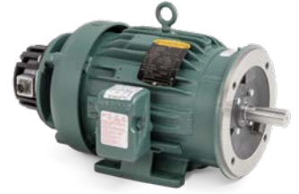
Vector Duty Totally Enclosed