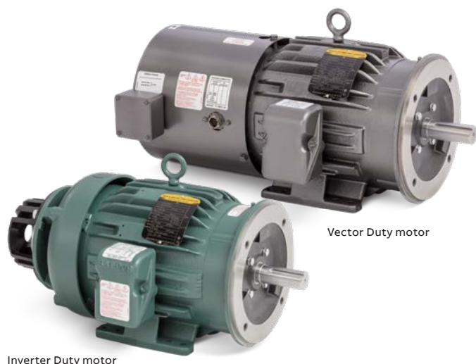
Inverter Duty motor