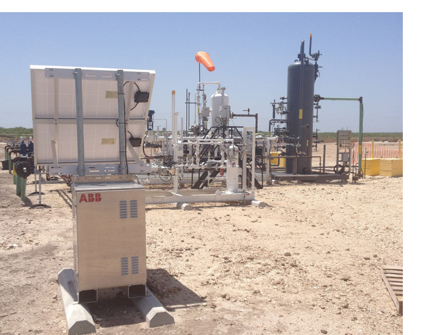
ABB offers an assortment of communication kit options including mounting brackets, wiring harnesses, and various brands of communication devices such as spread spectrum and licensed radios. Contact ABB for assistance in determining the kit that best suits your needs. Contact ABB for more information on available accessories.