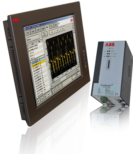
DriveMonitor, a dedicated monitoring and diagnostics system

DriveMonitor, ABB's award-winning monitoring and diagnostic system, watches the drive system, continuously tracking its status and collecting data.